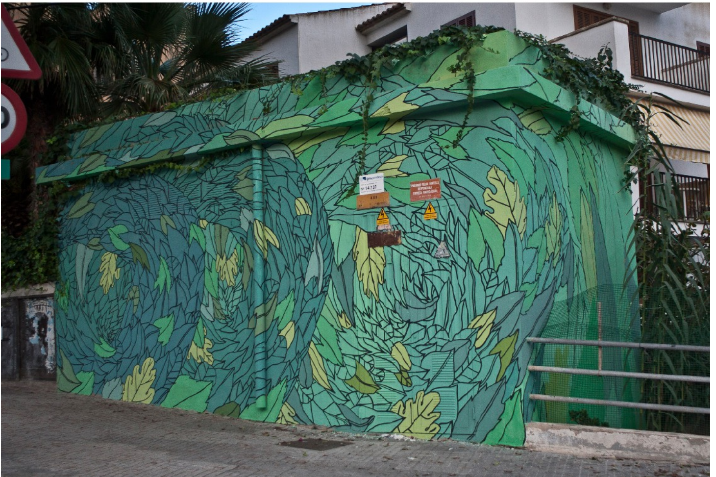
Reforestation storming / 4x9m / Mallorca, Spain / For Betart / 2014