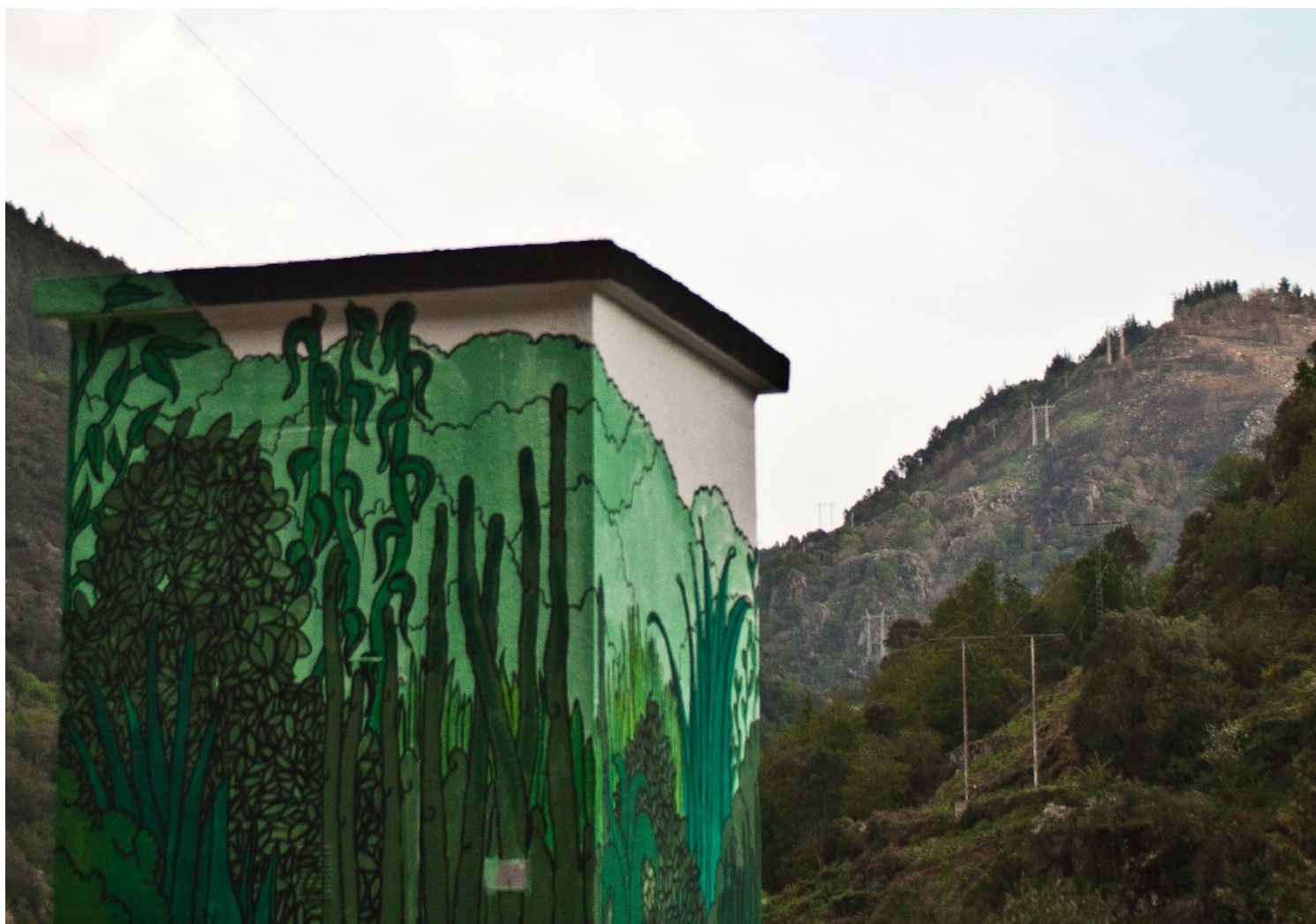
Reforestation III, IV and holding house / Galicia, Spain / 2014