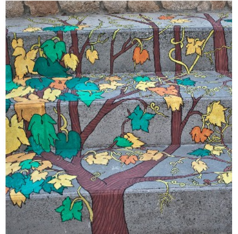
Reforestation, vine plant / 3x32m / Sober, Galicia, Spain / 2014