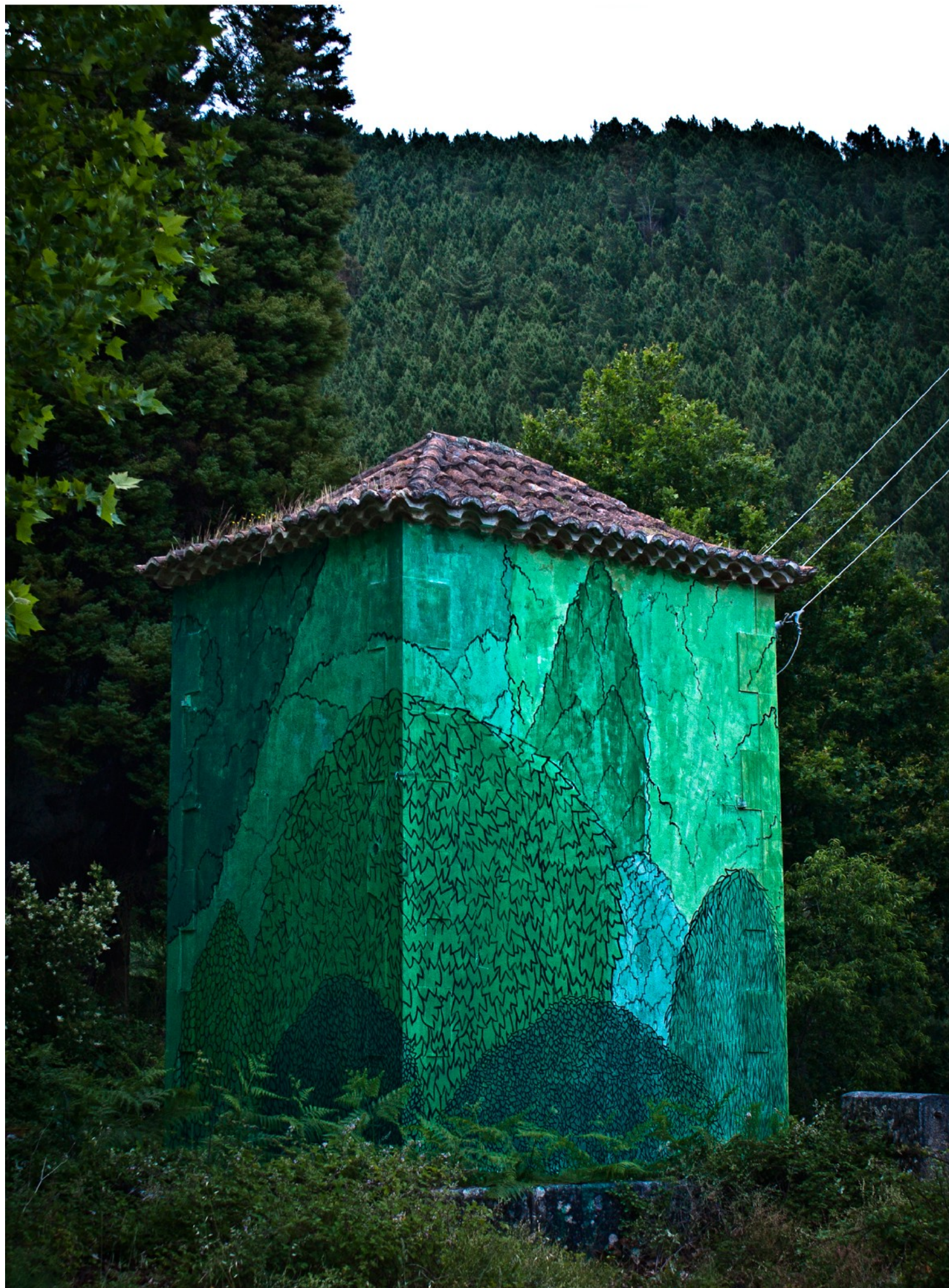
Reforestation tower / 6x6m / Galicia, Spain / 2014