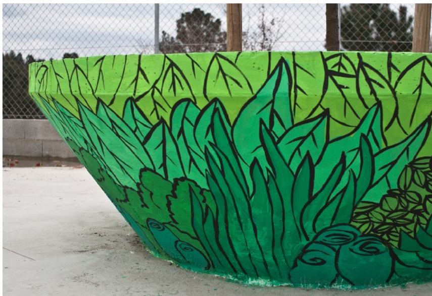
Green at the garden / Galicia, Spain / Together with Michelin / 2014