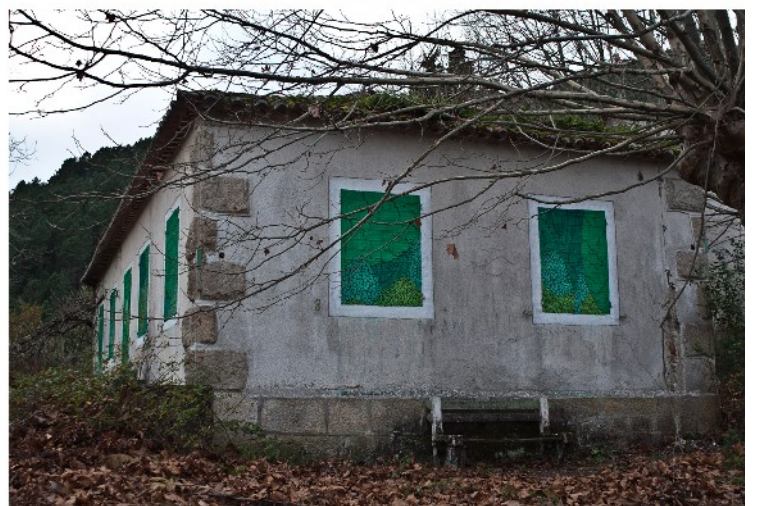
Reforestation indoors / Galicia, Spain / 2014