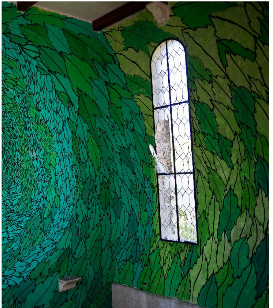
Castanea reforestation / 7x40m / Abandoned church / Galicia, Spain / 2014