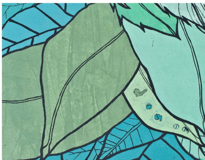
Reforestation storm / 4x18m / Mallorca / For Betart / 2014