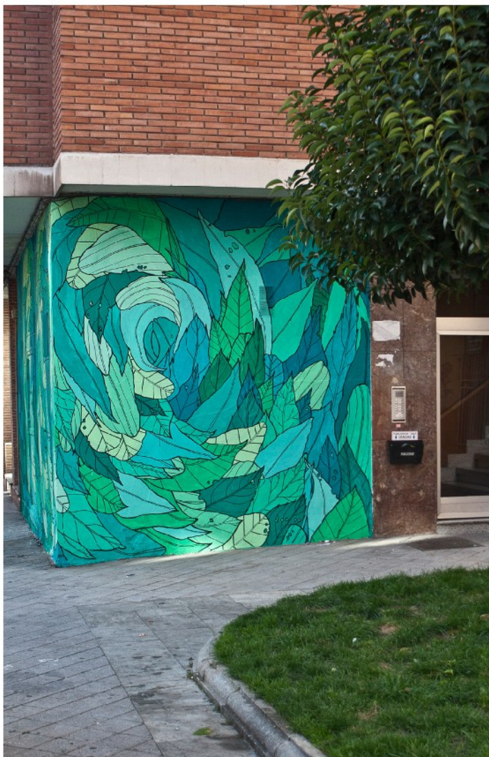
Storms / 3,5x9m / Salamanca / 2014